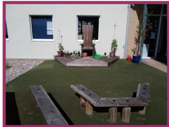
The Outside Classroom