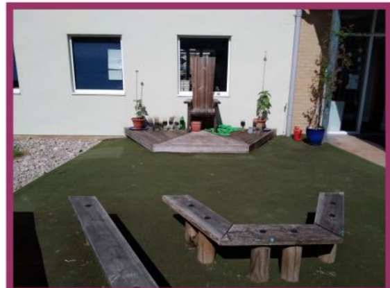
The Outside Classroom